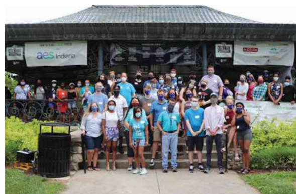
Recognizing the 2021 graduating class of Bigs and Littles in the Spring of 2021!