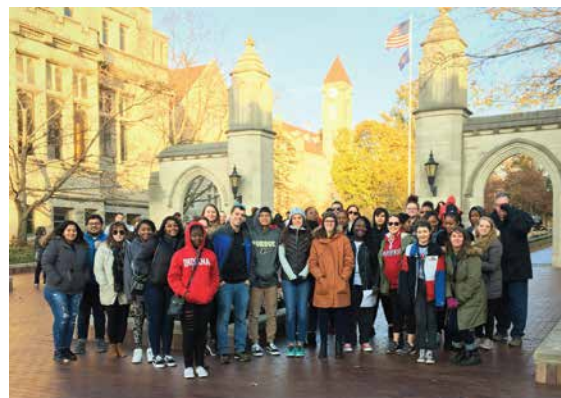
A group of Bigs and Littles visit IU Bloomington.

When Littles enter high school, BBBSCI continues to support, coach, and provide resources for matches as they work toward graduation. Big Futures offers the over 400 high school-aged Littles served by BBBSCI annually, a series of opportunities focused on the school-to-workforce pipeline. These events encourage Littles to develop hard and soft skills, assist in exploration of different career paths, break down barriers, help Littles make important professional connections, and provide Littles access to important resources.