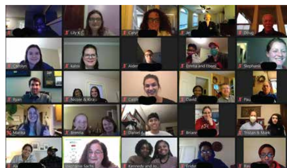
Big Futures programming went virtual in 2020!