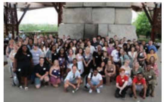
Recognizing the 2022 graduating class of Bigs and Little in the Spring of 2022