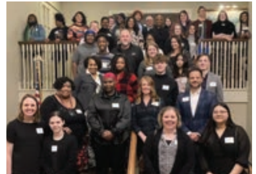
Etiquette Dinner and Lesson 2022