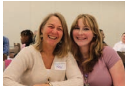
Matches participate in a networking activity at the Career Exploration and Networking Event